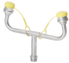
570004 S/STEEL EYEWASH NOZZLE ASSEMBLY WITH YELLOW PLASTIC DUST CAP