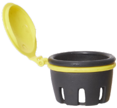
570017 RUBBER EYEWASH CUP WITH YELLOW DUST CAP