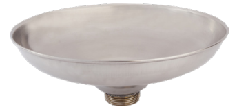
570006 S/STEEL EYEWASH BOWL