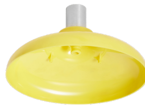
570007 ABS PLASTIC SHOWER HEAD WITH SWIRLTEC NOZZLE