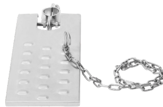
570020 S/STEEL FOOT TREADLE