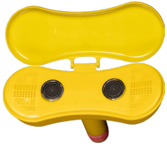
570027 YELLOW ABS PLASTIC EYE & FACE WASH NOZZLE