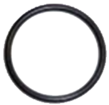
570024 BLACK WASHER FOR STANCHION JOINT