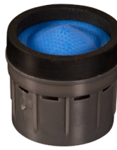
570018 EYEWASH NOZZLE AERATOR INC WASHER