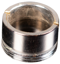
570032 304 S/STEEL RING SUITS EYE & FACE WASH AERATOR