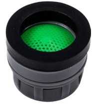
570031 EYE & FACE WASH NOZZLE AERATOR INC WASHER