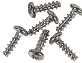
570030 304 S/STEEL SCREWS - Pack of 6