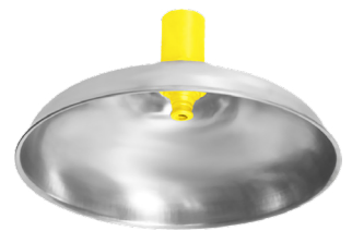
570008 S/STEEL SHOWER HEAD WITH SWIRLTEC NOZZLE