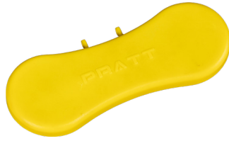
570029 ABS PLASTIC DUST CAP