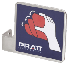
570010 S/STEEL PUSH HANDLE FOR 570012