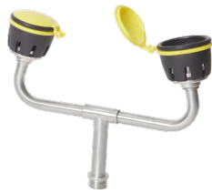
570003 S/STEEL EYEWASH NOZZLE ASSEMBLY WITH RUBBER EYECUP