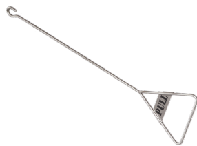
570016 S/STEEL PULL ROD