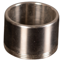
570028 304 S/STEEL RING SUITS EYEWASH AERATOR