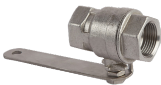
570014 25mm S/STEEL BALL VALVE WITH LEVER ARM